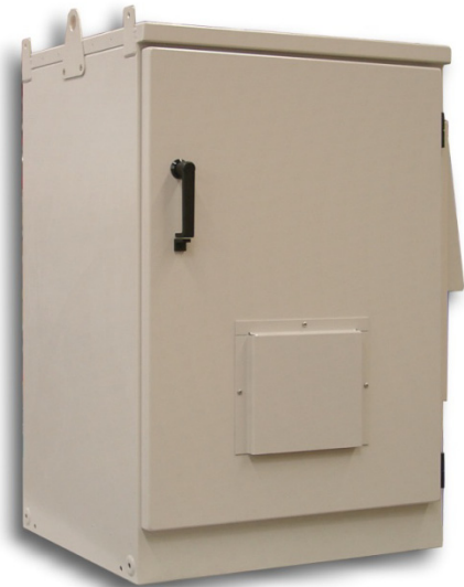
RAC35 with direct air cooling option

Adjustable components, mounting options, and a wide variety of kits and accessories provide exactly what you need to deploy your equipment in any environment or location.