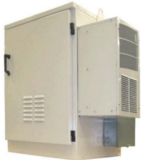
RAC35 with side mount air conditioner and optional AC load center